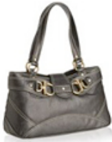
Hype pebble leather shoulder bag