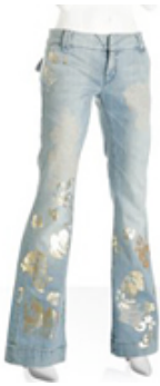
Allen B. faded wash gold embellished jeans