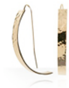
Argento Vivo gold hammered linear earrings